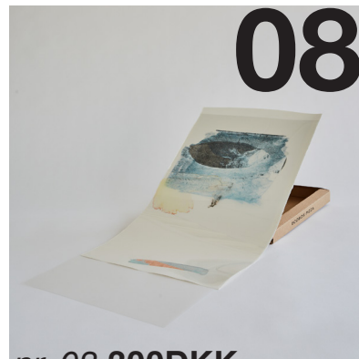
nr. 03 300DKK Transferprint, paper, polyfoil 34x37cm