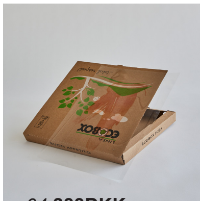
nr. 04 300DKK Transferprint, polyfoil 37x37cm