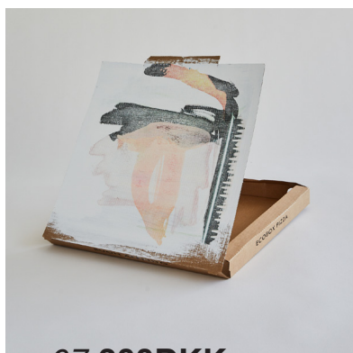
nr. 07 300DKK Transferprint, acrylics 32x32cm