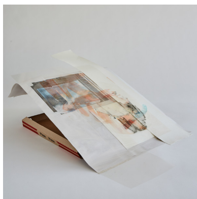
nr. 11 500DKK Transferprint, paper, polyfoil, silver leaf 45x75cm