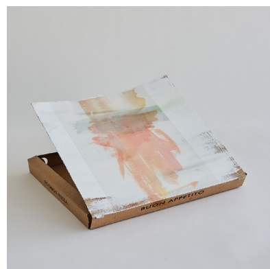
nr. 12 300DKK Transferprint, acrylics, polyfoil 32x32cm