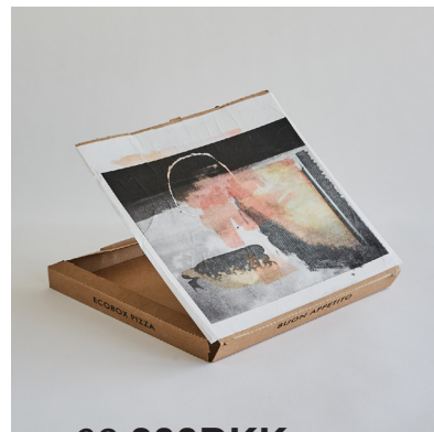
nr. 09 300DKK Transferprint, paper, photogravure 32x32cm