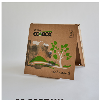
nr. 08 300DKK Transferprint 32x32cm