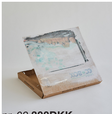
nr. 02 300DKK Transferprint, acrylics, polyfoil, silver leaf 32x32cm