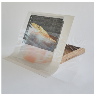
nr. 10 300DKK Transferprint, paper, polyfoil 57x42cm