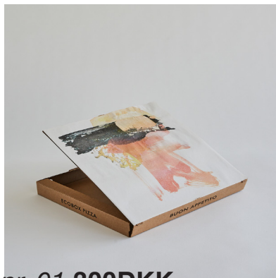
nr. 01 300DKK Transferprint, paper, silver leaf 32x32cm