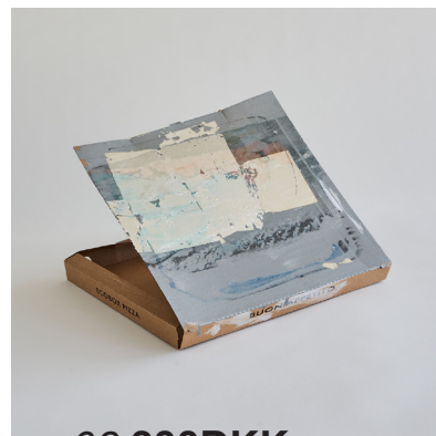
nr. 06 300DKK Transferprint, acrylics, silver leaf 32x32cm