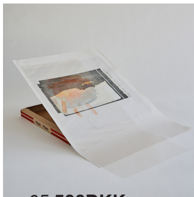
nr. 05 500DKK Transferprint, paper, polyfoil 45x75cm